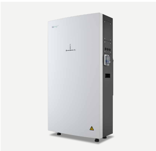
ALL IN ONE & GIV-GATEWAY